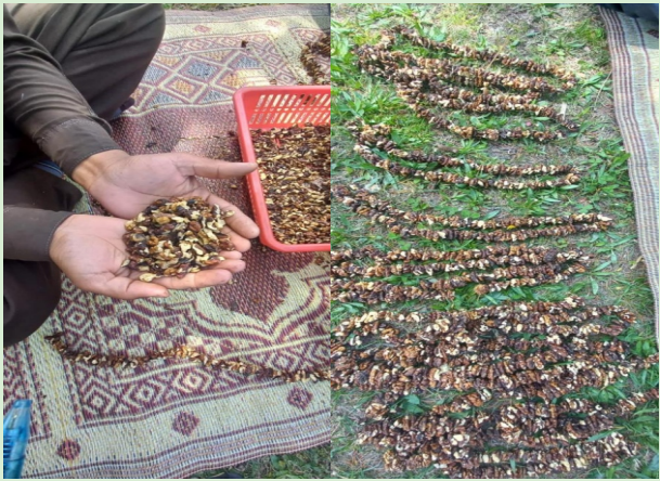
Staff of Food Technology Section of Agriculture Research Station Seenlasht, Chitral are busy in making traditional dry Walnut product (Kelau).