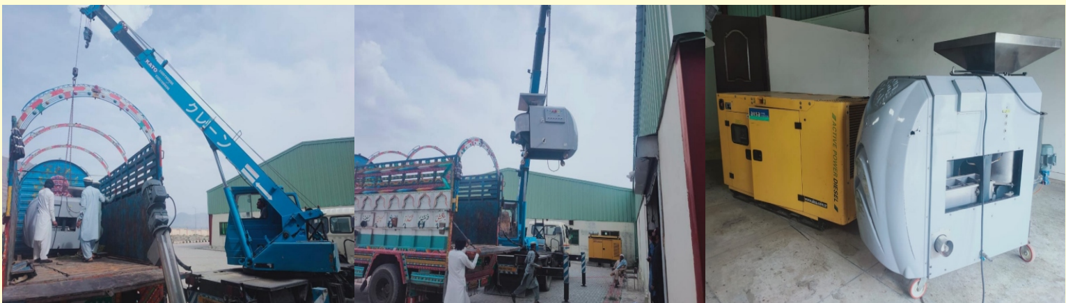
Olive extraction Machine along with accessories shifted from Research Station Kohat to Agri Park Wana South Waziristan Tribal District.