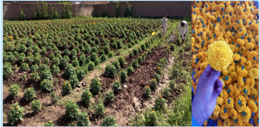
District Peshawar, 1st Picking of Marigold flowers from Technology Transfer Plot at Mattani circle, laid out under ICT Based Improvement in Agriculture Services in Khyber Pakhtunkhwa.