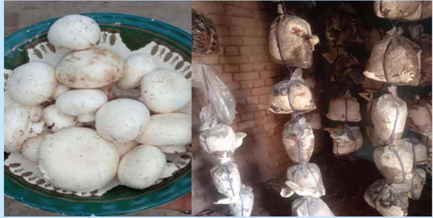
Button Mushrooms cultivation at Tirah Maidan, District Khyber under Agriculture Transformation plan Merged Areas by Agriculture Extension Department, District Khyber.