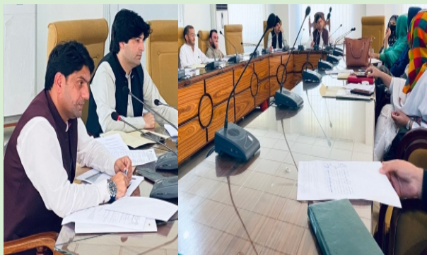
55th Meeting of Farm Forum Advisory Committee held at Directorate General Agriculture Extension Khyber Pakhtunkhwa. Participant were briefed about the activities carried out at Bureau of Agriculture Information, Peshawar during Quarter January-March.