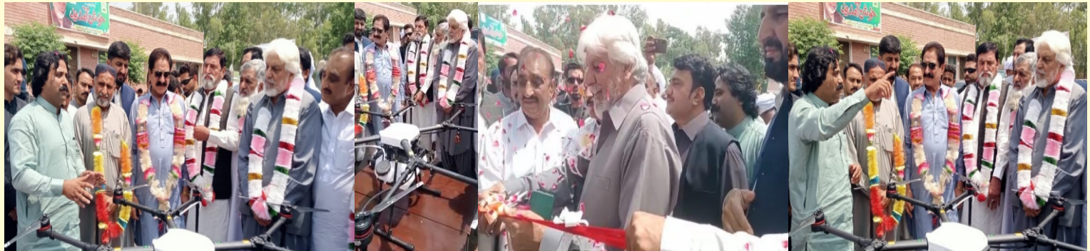
Inauguration Ceremony of Agriculture Drones, Farm Machinery etc. at Model Farm Services Center D.I. Khan. The Honorable Minister for Agriculture Livestock and cooperative Department Honored the occasion.